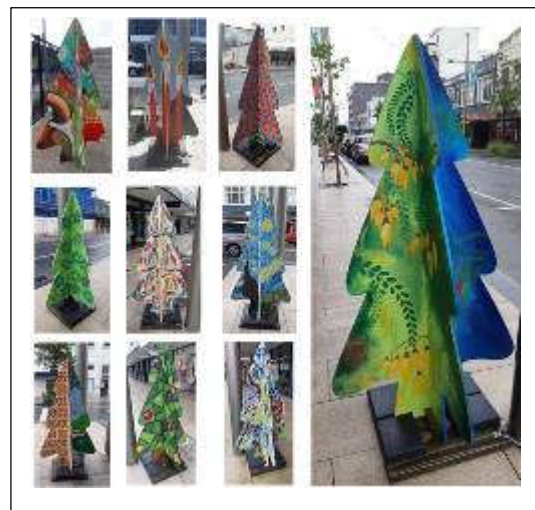
2020 Street Art Trees

Christmas tree concept is designed by Nexus Display Solutions. The tree slots together, it is received flat packed. Base, steel fixtures included with tree.